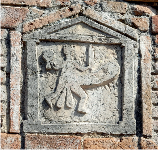
Fig. 7 : Ithyphallic figure inside small shrine at entrance of Modestus Bakery, Pompeii.

Source: DUNN & DUNN 2019, "VII.1.36, Pompeii: Detail of ithyphallic plaque" (cropped). Photo by Buzz Ferebee. © Jackie and Bob Dunn. www.pompeiiinpictures.com . Reprinted by permission.