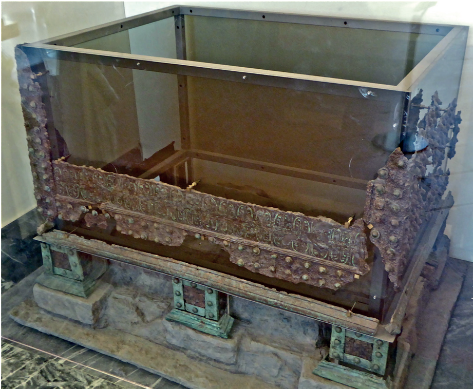
Fig. 2 : Remains of the strongbox from the south side of the atrium.