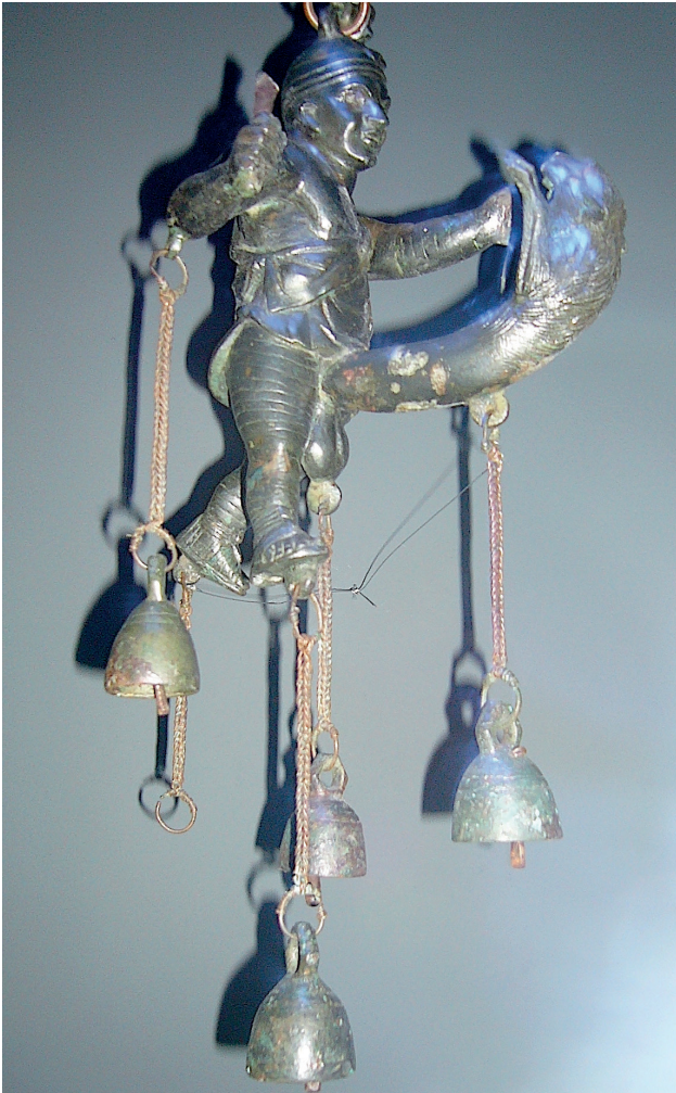
Fig. 5 : Gladiator tintinnabulum from Pompeii.

Source: Wikimedia Commons, "Amuleto romano in bronzo: Tintinnabulum a forma di gladiatore" (cropped). The image is in the public domain under the CC0 1.0 Universal Public Domain Dedication.