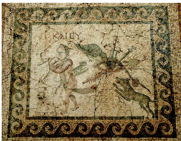
Fig. 3 : Mosaic from the House of the Evil Eye.

The Vettii, too, were not defenseless against the baneful influence of the evil eye. Various apotropaic practices and devices were believed to offset or negate its effects, including extending the middle finger ( digitus infamis ), inserting the thumb between the middle and ring finger in a mano fica gesture, sticking out the tongue, spitting three times, wearing special amulets or pendants, inscribing or reciting incantations and prayers, suspending tintinnabula (bells attached to apotropaic images) over thresholds, and ingesting or displaying plants and herbs such as garlic, rue, and dill [27].