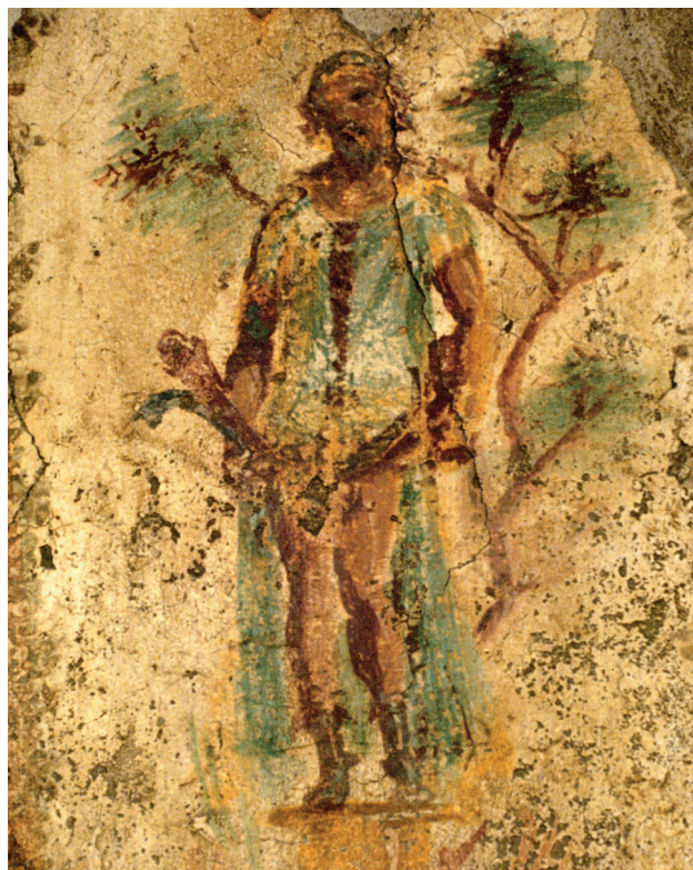
Fig. 4 : Biphallic Priapus from the lupanar of Pompeii.

Although the phallus itself was held to be an effective apotropaion , humor, too, was understood to ward off the evil eye [38]. Apotropaia that depicted the phallus humorously were thus doubly effective. An image of Priapus sporting not one but two phalluses in the Lupanar of