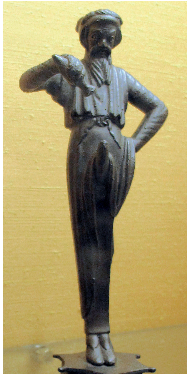
Fig. 8 : Priapus anoints his phallus with oil. Source: Wikimedia Commons, “Statuette di priapo che versa un liquido sul proprio membro”. Photo by Saiko (cropped). Available under the Attribution-ShareAlike 3.0 Unported (CC BY-SA 3.0) license.

Perhaps more humorous than the enlarged and semiturgid look of Priapus’s phallus was the use to which it was put in the fresco in the House of the Vettii. As we have seen, in the Priapea , the phallus of Priapus is depicted as an instrument of penalty, ready to punish thieves in the rustic gardens that the god oversees. A sense of “strangeness” or “absurdity” (ἄτοπία) is thus expressed in the image of Priapus in the House of the Vettii, as the god’s phallus appears “out of place” (ἄτοπος), resting unexpectedly atop one plate of a balance scale [69]. As Marilyn Skinner points out, “Visually, a painting of Priapus weighing his member from the House of the Vettii at Pompeii tells a corresponding joke: the counterweight of the god’s organ is a large sack of coins, and the two are nicely in balance. The phallus is worth its weight in gold” [70].