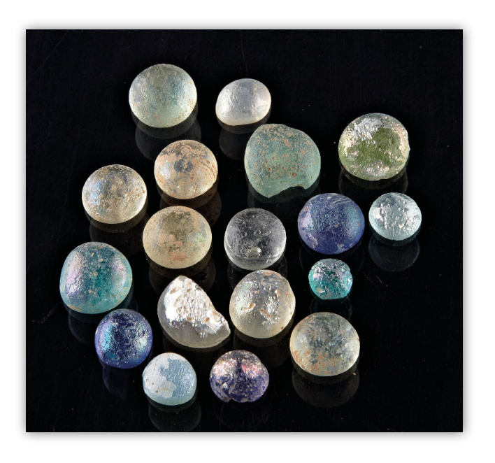
Figure 5: Olynthus. Glass counters. After Ignatiadou 2010: cat. 430.

The counters were made by firing chunks or crushed glass, on a flat plaster surface. The circular shape was achieved without tooling and is merely due to the surface tension of the viscous glass. [34] A find in Rhodes confirms the use of the technique. There, among the waste of a Hellenistic glass workshop were found reject counters showing that the glass was fired on trays in rows in such close order that some counters were accidentally joined to an elongated mass with two "peaks". This simple technique produces counters with irregular circular shape and a natural, non-polished surface. Variations in size are of no importance for the conduct of the game, thus they show absence of intent to control the amount of glass to be fired. Variations in the same colour seem to be equally unimportant. The main colours, however, correspond to those of other contemporary glass articles. It is therefore probable that counters were made from leftovers; colourless counters were made from leftovers from the manufacture of colourless inlays and vessels, and coloured counters from leftovers from the manufacture of coloured vessels and beads.