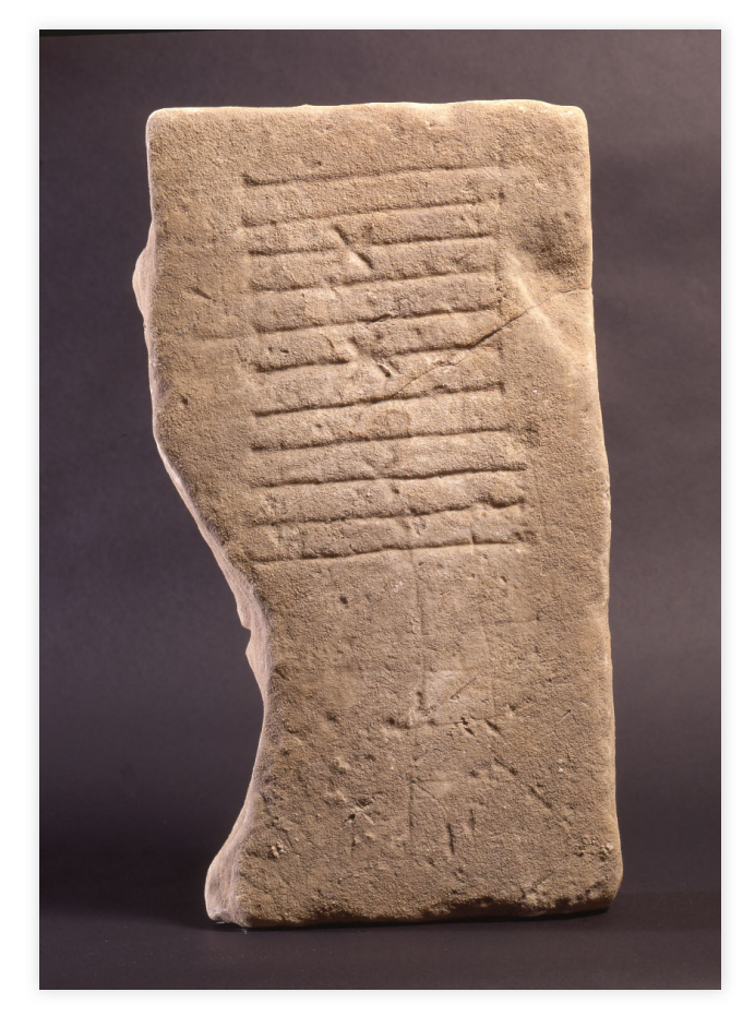
Figure 1: Abdera, Thrace. Marble gaming table with five lines and poleis boards. After IGNATIADOU 2013: pl. 36.

Since the 4<sup>th</sup> century BCE, a special cup was used for casting the dice, whether in the course of a board game, or not. The Greek names for the cup were the (wicker) \kappa \dot{\eta} \theta iov , or the \phi i \mu \dot{o} \zeta , or \sigma \dot{\kappa} \dot{\rho} \alpha \phi \dot{o} \zeta , or \mu \dot{o} \delta io \dot{o} \zeta ; the Roman ones, when it also took the shape of more complex constructions, were called fimus , fritillus , turricula or \pi \dot{\nu} \dot{\rho} \dot{\rho} \dot{o} \zeta / \pi \dot{\rho} \dot{\rho} \dot{\rho} \dot{o} \zeta (the tower). [17]