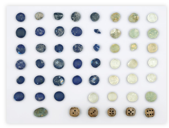
▲ Figure 2: Sevaste, Pieria. Gaming set with glass counters and rectangular dice with dots. After Ignatiabou 2013: pl. 35.

8 to 20 mm. The spots are circular hollows about 1-2 mm in diameter. The 3 and 4 marks are always placed on the smaller sides, which are more difficult to cast, and thus more rewarding. [21] Each gaming set usually includes three dice, [22], but there are also sets with fewer dice, and one with five dice (n° 20). The dice have features indicating a local production with special characteristics such as the rounded edges and corners, [23] the oblong shape [24] and the plain dot marks. [25] The only exception is the set of three cubic dice from Kitros-Alykes, marked with dots inside circles (fig. 3; grave 80, n° 10). Most of them indicate the production of a workshop in central Macedonia, perhaps in the milieu of a rich local tradition of bone and ivory carving during the Late Classical Period.