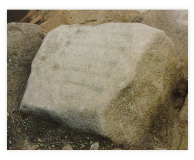
Figure 7. Stageira. Marble slab with incised five lines board. After Ignatiadou 2013: fig.183.

The earlier Greek find of five lines is that of the 7<sup>th</sup>/ 6<sup>th</sup> century BCE from Anagyrous in Attica. It is a small clay gaming table, the horizontal surface of which is decorated with four figurines of mourning women. The same surface carries five parallel, straight grooves ending in small hollows, thus supplying an early form of the game with 2+1+2 lines. Counters were not found but a clay die was unearthed. [42] A later 6<sup>th</sup>-century BCE