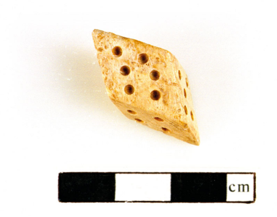
Figure 4: Aiginion, Pieria. Rhomboid die. After Ignatiadou 2013: fig. 187.2.

Knucklebones could also be used as dice. Each of their four sides had a special name [29] and corresponded to one side of a regular die, excluding 2 and 5. The knucklebones' gambling game was usually played with four pieces and the optimum throw (usually called Aphrodite/Venus) required that every item was showing a different side.