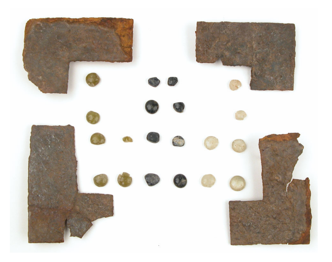
▲ Figure 8. Derveni, grave B. 8.1. Glass counters and iron reinforcements of folding board. After Ignatiadou 2013: fig. 175.5. ▼ 8.1. Digital reconstruction by E. Kotoula. After Ignatiadou 2013: fig. 185.

The type of board may have been the five lines because roof tiles with that game are found in contemporary sites, burials, sanctuaries and settlements. Near Pydna, a few roof tiles thus preserve five incised lines that run parallel but are not very carefully done. The characteristic triangles between the lines, which are explicitly seen on stone gaming tables, appear also here. The most complete example is a Corinthian-type (flat) tile (nº 23; fig. 9). It was found in a residential area of the first half of the 4th century BCE, in a room identified as an andron with a plain mosaic and a continuous wooden bench in place of banqueting couches. It is important as it allows to suggest that the game was being played in Macedonia from as early as the first half of the 4th century BCE during banquets, on makeshift tileboards and possibly with pebbles in place of counters. [54] A Laconian-type (i.e. curved) tile, incised with the outline of five lines, was retrieved in the main room of the sanctuary (no 25) just across the border of Macedonia to Thessaly, at the Tembi pass. A few incomplete Laconian-type tiles were also found in the same region, some in burials (e.g. nos 12 and 16; fig. 10).